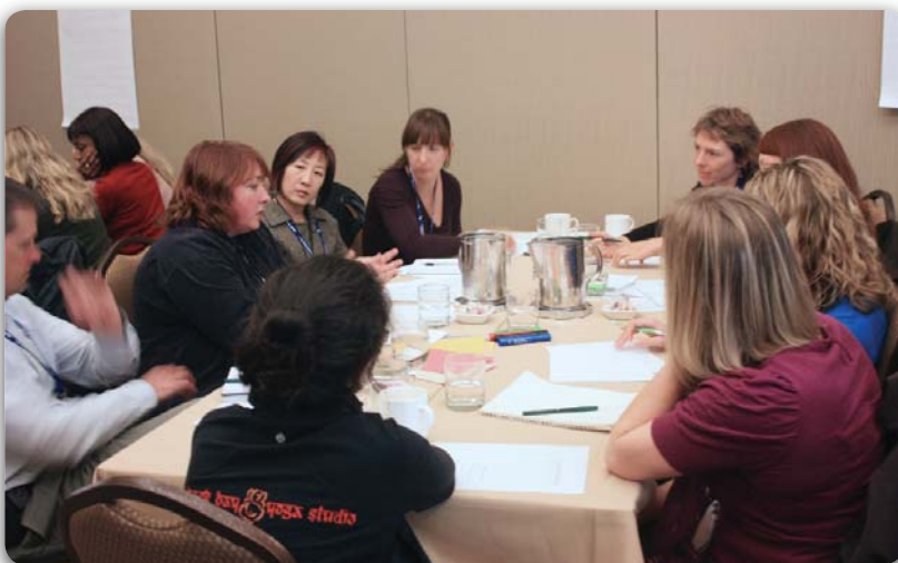
CAMPBELL AND COCHRANE EQUITY METHODS GROUP, LOGIC MODELS WORKSHOP, 18TH COCHRANE COLLOQUIUM; KEYSTONE, COLORADO

Over the past year, the Equity Methods Group has been providing leadership and guidance to the new Campbell International Development Coordinating Group, which prepares systematic reviews for The Campbell Collaboration. The Equity Methods Group helped the group develop title registration forms and ensure they address issues of equity that are relevant