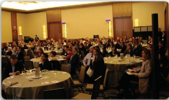
↑ 9TH ANNUAL COCHRANE CANADA SYMPOSIUM, VANCOUVER, BC

The Canadian Cochrane Symposium is an important annual event providing the opportunity for the Cochrane community in Canada and our stakeholders to learn, network, exchange knowledge and foster new relationships and opportunities. Symposia rotate around the country, with each event hosted by a different Cochrane group or site. Cochrane Canada's 9th Annual Symposium was held in Vancouver, B.C. on 16 - 17 February 2011 with pre-symposium workshops taking place on 14 - 15 February. The theme of this year's symposium was Early Exposure to Cochrane: accessible, credible and practical , focusing on ensuring that evidence-based decision making and Cochrane Systematic Reviews are being taught in medical and health sciences schools. Over 200 people attended the 2011 Symposium. It was a major success, and we look forward to Cochrane Canada's 10th Annual Symposium, to be held in Winnipeg, Manitoba.