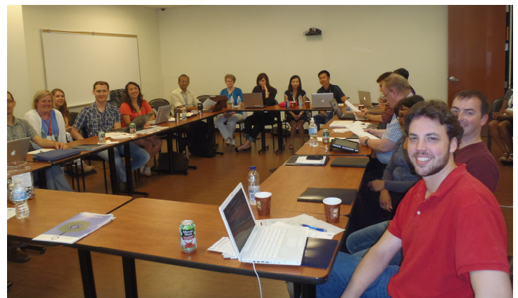
Participants of the Standard Author Training workshop in Hamilton, ON.

and writing a protocol, to analyzing studies and presenting their results. It was a great group of clinicians, statisticians, allied health professionals, researchers and students who were eager to learn, posed insightful questions and kept us on our toes! Some participants have already applied their knowledge to existing or recently registered reviews. We wish you all success and