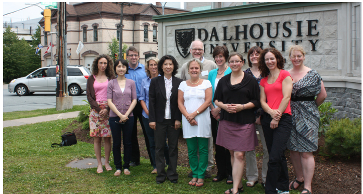
Participants and trainers gathered in front of Dalhousie University, Halifax, NS.

For other Cochrane training opportunities, click here: ccc.cochrane.org/training-and-events