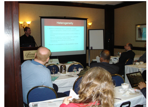
Symposium participants attending an oral session on heterogeneity in systematic reviews.