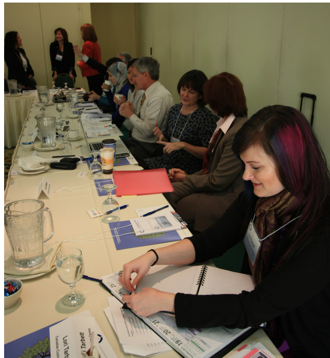
Attendees at the Canadian Cochrane Centre Partners Forum, 19 November 2012, Ottawa, ON.

Participants of the forum gave positive feedback and indicated that they found the experience to be an “excellent opportunity for brainstorming” and a “great opportunity to network and share ideas”.