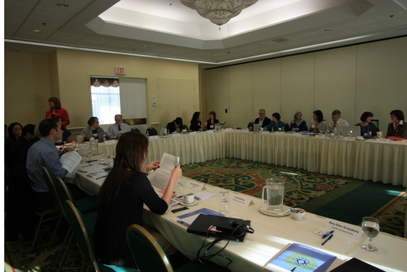
Partner representatives at the Canadian Cochrane Centre Partners Forum, 19 November 2012. The Partners Forum took place at the Southway Inn, Ottawa, ON. Eighteen out of 25 partner organizations participated in the Forum ( page 4 ).